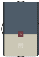
Surf foil box 560x850mm