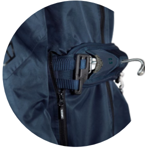
HARNES INSERT VIEW

The Blizzard jacket creates a cocoon around the Kiter that allows a far better resistance to cold even with a standard wetsuit.